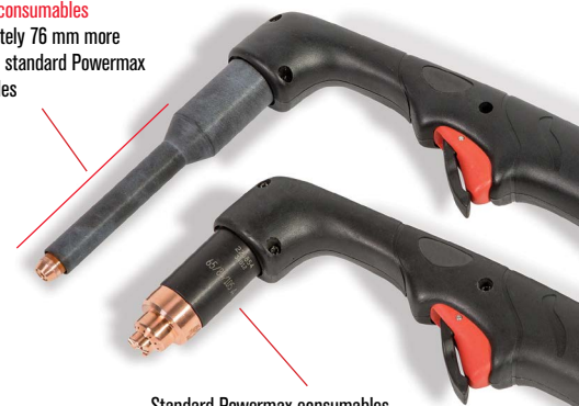
Standard Powermax consumables

HyAccess consumables Approximately 76 mm more reach than standard Powermax consumables